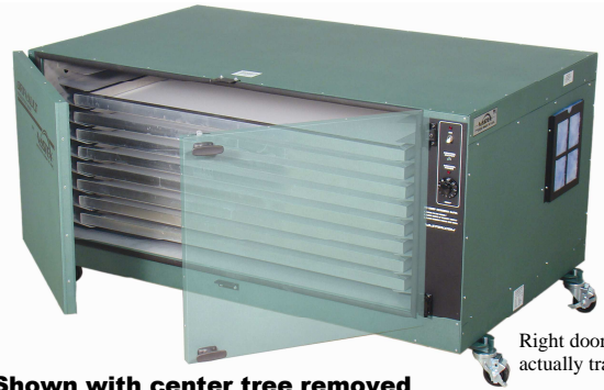
Shown with center tree removed and 47" x 31" screens.

The VDC-513610 is capable of drying (20) 25" x 36" screens or (10) 51" x 36" screens. The unique positionable center tree accommodate all these sizes and more!