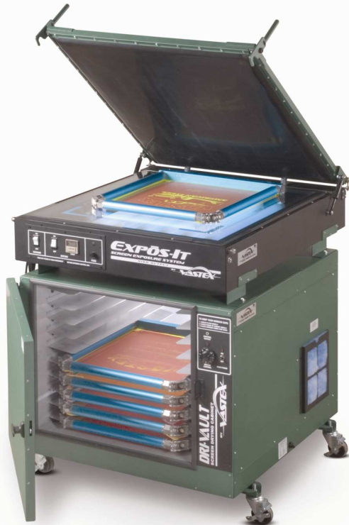
EXPOSIT model# E2331 and DRIVAULT model# VDC-243410 Combo, includes wheels