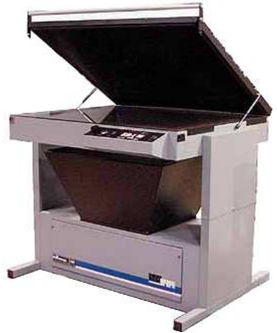
Metal Halide Exposure unit AM-150

Touch Activated, User Friendly Keypad & LED Digital Display