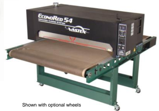
Shown with optional wheels

Focused Exhaust System Quickly removes fumes and moisture for faster curing of plastisol, water-based and discharge inks. Digital Belt Speed Display Now standard for better control and better results