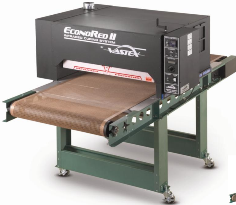
EC-II-30 shown with optional wheels