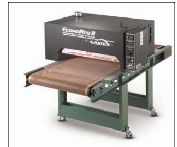
EC-II-30 shown w/ optional wheels