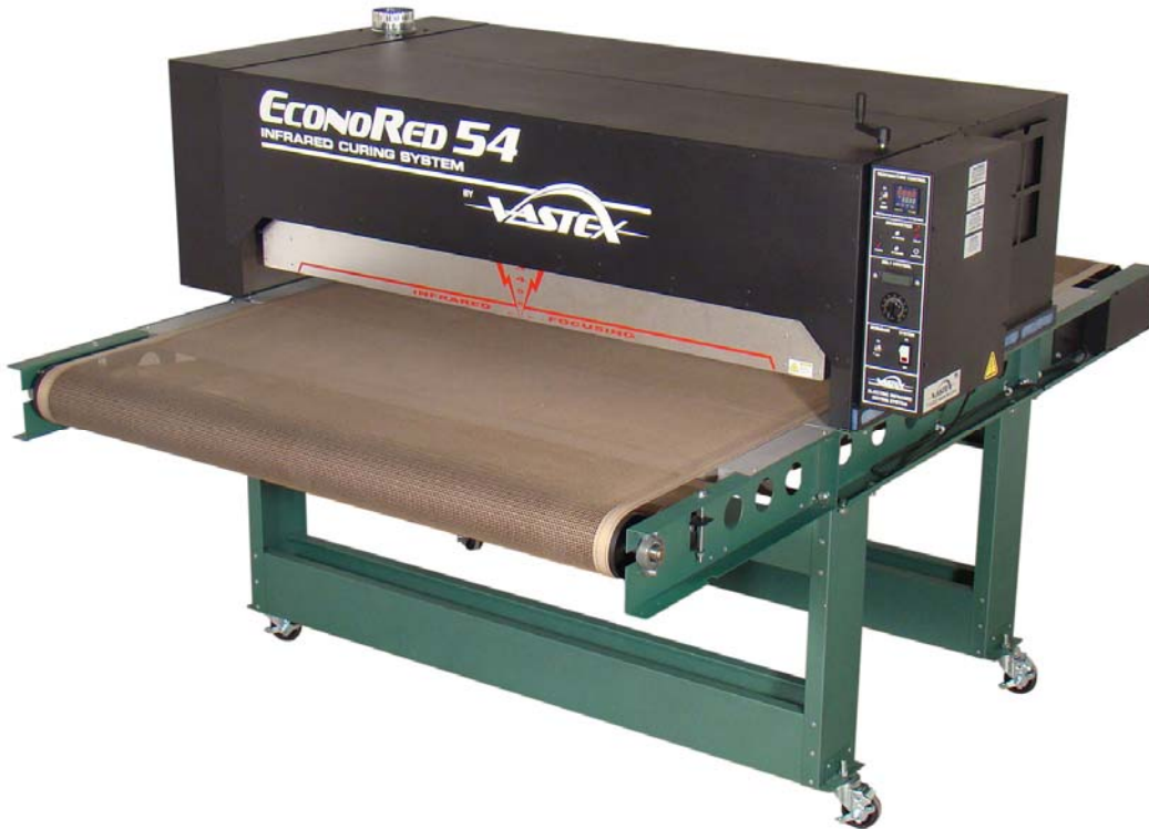
EC-II-54 shown with optional wheels