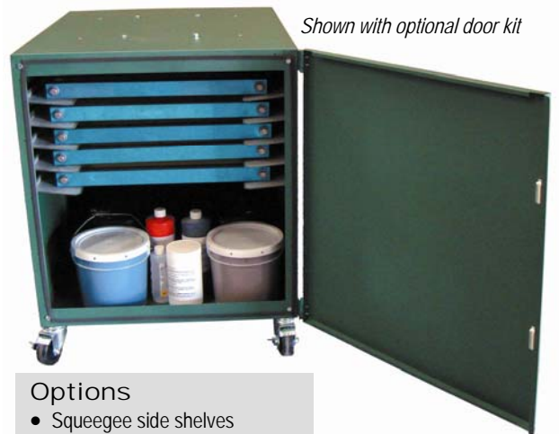
Shown with optional door kit