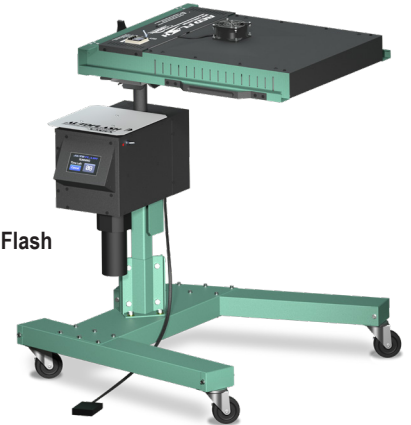
RedFlash shown with AutoFlash and SHHD Stand