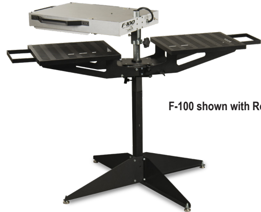
F-100 shown with Rotary Table